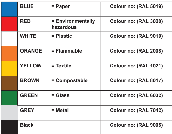
Item No 10030 + 19030